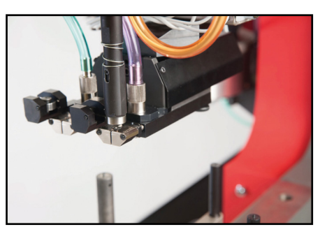
3. Clamp Tool And Move Into Position Station 2.