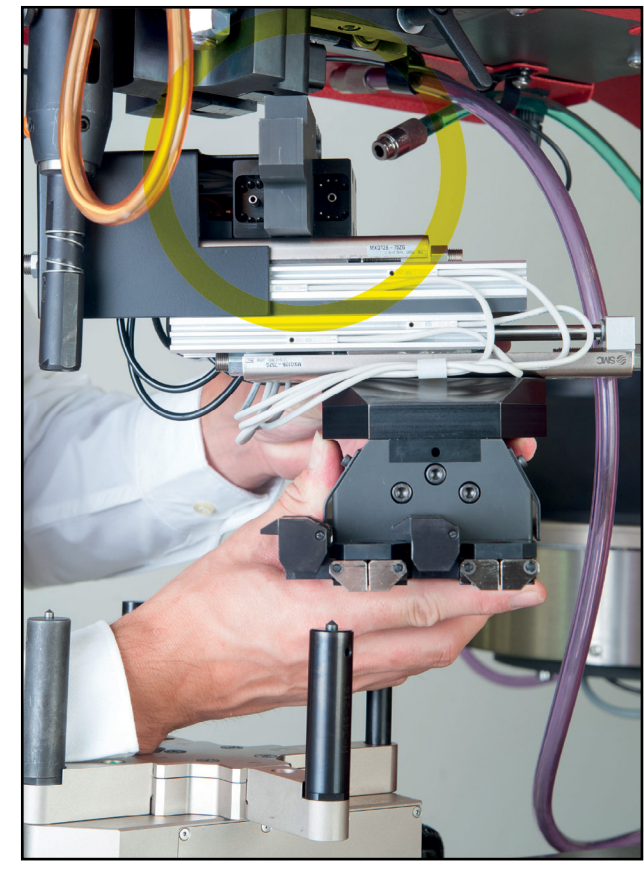
Dual station removed.