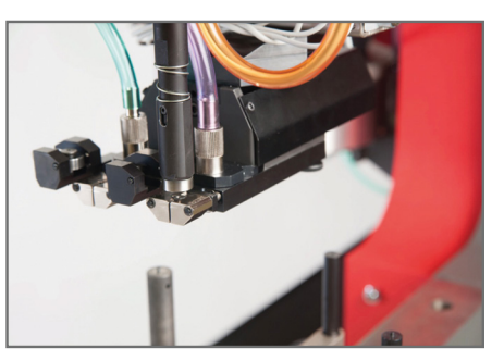
3. CLAMP TOOL AND MOVE INTO POSITION STATION 2.