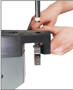
Bottom Mount Reverse Flange Anvil Holder.

Optional anvil holders and tooling can be easily installed on all new and existing PEMSERTER® Series 4® presses.