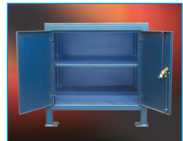
Lockable Tool/Accessories Storage Cabinet