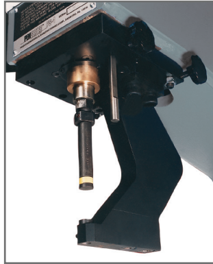
Top Mount Reverse Flange Anvil